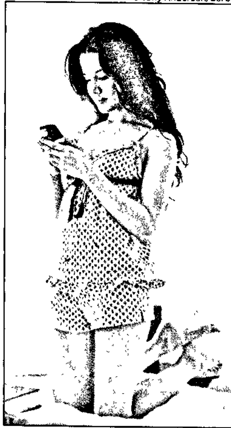
SMARTPHONE JUST GOT SMARTER: The PaperPhone uses no power when nobody is interacting with it

require paper or printers, said Vertegaal. He said: "The paperless office is here. Everything can be stored digitally and you can place these computers on top of each other just like a stack of paper, or throw them around the desk."